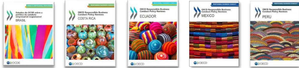
5 RBC Policy Reviews