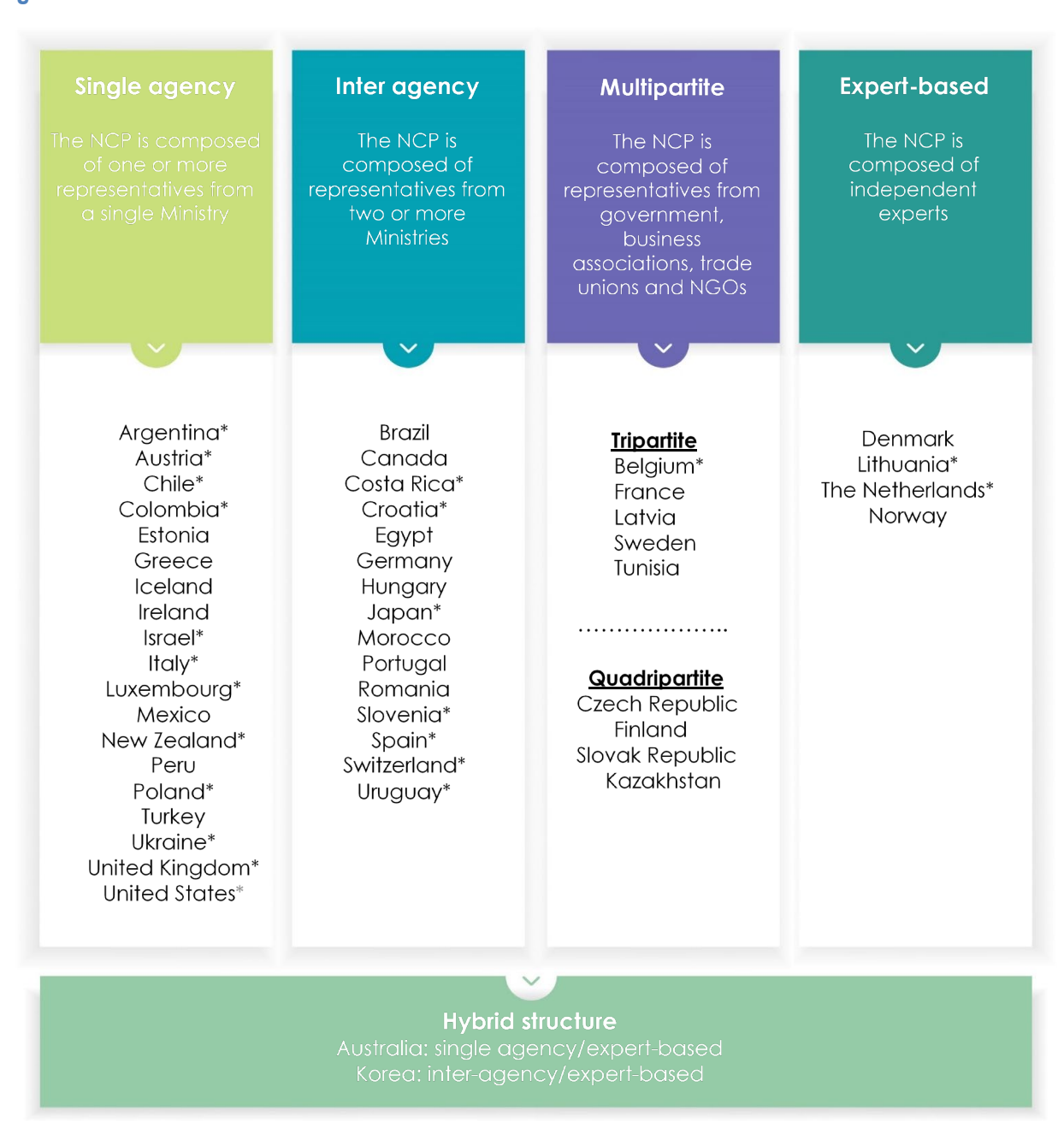
Figure 3.1. NCP main structures

Note: Countries with an asterisk (*) have an advisory body including other government departments or stakeholder representatives in an advisory capacity.