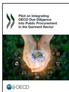
Pilot due diligence into Public Procurement