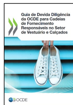
Portuguese translation of the Garment e Guidance